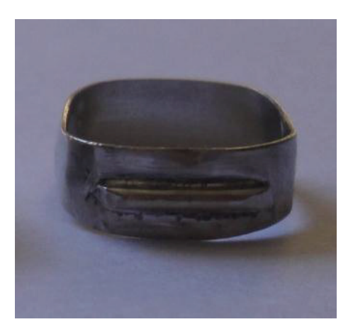
FIGURE 2: Laser soldered band (LSB).

This study was approved by the ethics Committee from Pontifícia Universidade Católica do Rio Grande do Sul (Porto Alegre, Brazil). Stainless steel metallic orthodontic bands