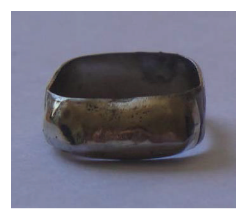
FIGURE 1: Silver soldered band (SSB).

cadmium has been considered a mutagen and may be related to the occurrence of cancer [10–12].