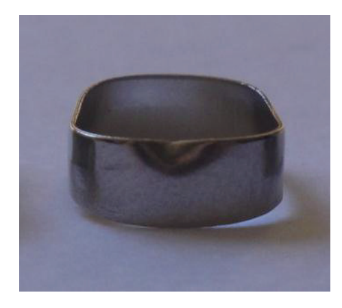
FIGURE 3: Band without any solder (as received—WSB).

(Universal bands for upper molars Morelli, Sorocaba/SP, Brazil) were evaluated. The bands, according to the manufacturer's information, are composed of Cr: 17-20%; Ni: 8-10%; Mo: max. 0,60%; and Fe. Three groups were formed: silver soldered bands (SSB-Figure 1), laser soldered bands (LSB-Figure 2), and bands without any kind of solder (WSB-Figure 3). For the silver solder group, in each band, a segment of stainless steel 1.0 mm wire (Cr: 17-20%; Ni: 8-10%; Mo: max. 0,60%; and Fe) was soldered using silver solder alloy (Ag 55-57%, Cu 21-23%, Zn 15-19%, and Sn 4-6%) and solder flux (Morelli, Sorocaba/SP, Brazil) heated by a butane microtorch (GB 2001, Blazer, Farmingdale, NY, USA). For the laser soldered group, the same 1.0 mm stainless steel orthodontic wire was soldered to the band using laser Nd: Yag (250 V, 12 ms; Dentaurum, DL 2002-S, Germany). The third group was composed of bands without any solder and was evaluated as received.