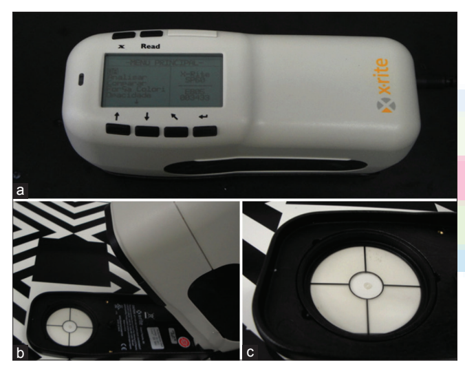
Figure 1: (a) Portable spectrophotometer (SP60 X-Rite, Grand Rapids, MI, USA); (b) Selection of a white background; (c) A sample of elastomeric ligature placed for color assessment

Quantitative and qualitative color assessments were carried out in the elastomeric ligatures as received (T0) and after 30 days in situ (T1). Color measurements were carried out using a portable spectrophotometer (SP60 X-Rite, Grand Rapids, MI, USA) in white background, under the same lighting, in a blind random sequence [Figure 1]. The spectrophotometer recorded numeric values in the coordinates L*, a*, and b* according to the CIE color system. Coordinate L* determines a lightness level from 0 (completely