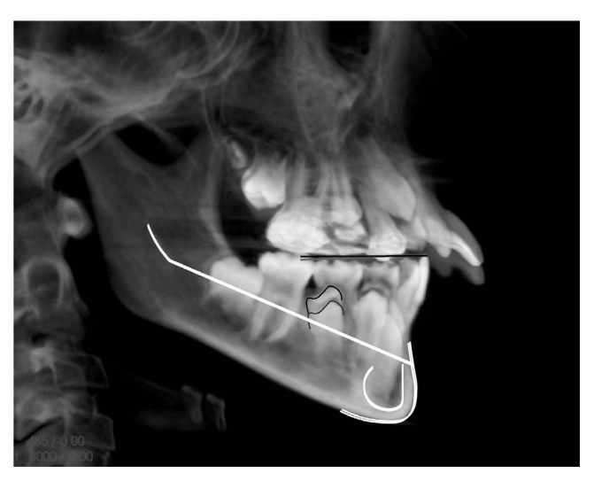
Figure 1. The anatomical reference line (ARL); superimposition of paired cone-beam computed tomography (CBCT) scans on the mandible's natural reference structures, described by Björk¹o; and the occlusal plane line (OPL).

enlargement, distortion, and superimposition of anatomic structures. Despite the clear limitation for the use of cone-beam computed tomography (CBCT) in children, a retrospective study using CBCT to evaluate eruption rates and correlate them with the tooth's development stage could improve clinician's interpretation of the radiographic assessments, aiding on the decision-making process with regard to time of treatment.<sup>2</sup>