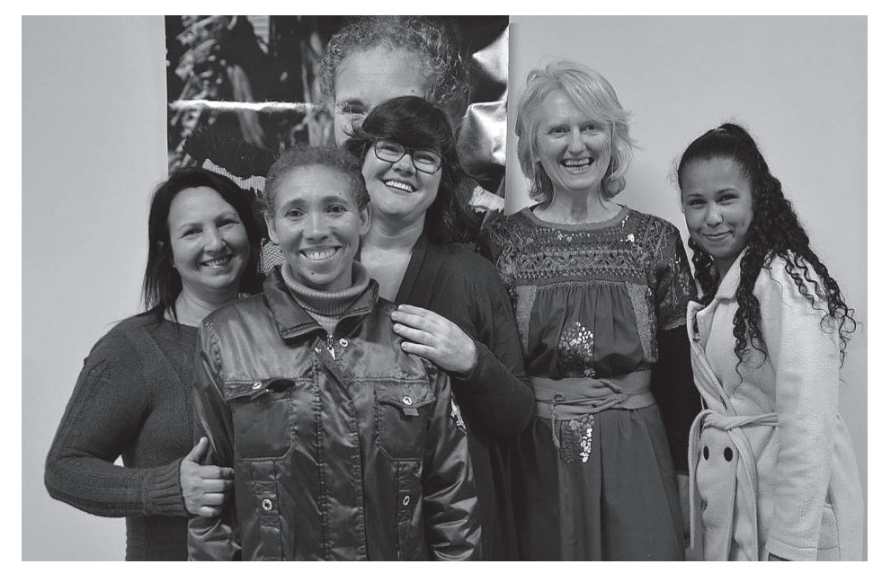
Photograph 7: "Women Weavers Challenge EJA" exhibition, IFRS, 10/26/2016 (photograph by Suzana Pires, 2016).

This way of conducting research reinforces what was discussed in the Latin American Meeting of Women Biblists briefly mentioned at the beginning of this article. When we admit that the body can be a hermeneutic category, and that subjects and their everyday stories form the hermeneutic process, we produce a hermeneutics of deconstruction and reconstruction, possibly hereby producing a hermeneutics that questions concepts given as the only ones and as "the" only truth, which ends up excluding new possibilities and so many other truths (CARDOSO, 1996). It is from this perspective that we carry on asking ourselves whether we are being coherent with the indispensable curiosity that feminist experiences teach us about: to seek other ways of producing knowledge!