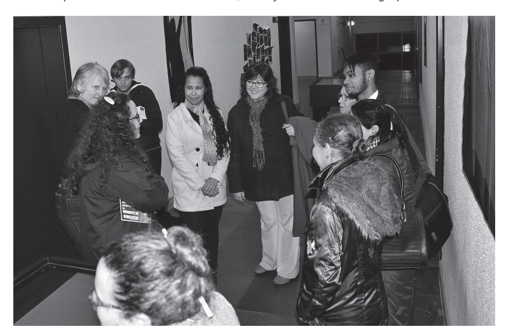
Photograph 4: Opening night of the "Women Weavers Challenge EJA" exhibition (photograph by Suzana Pires, 2016).

The first exhibition of the pieces was held at the Pontifical Catholic University of Rio Grande do Sul – PUCRS. For this exhibition, there was a photography session both with the pieces and the women artisans, if they so wished. Photographer Suzana Pires