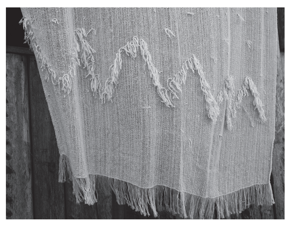
Photograph 3: The Ditch Curtain by Jaine Pereira, Rereadings of Alvorada.

The piece made by Jaine Navarro captured the spirit of what was proposed to the women weavers: to create something from an altogether different perspective. The distanced view in the works inspired by the choices of places that every woman made allowed for, in our opinion, a sense of belonging and recognition of the power of creation. And this grew more and more intense when we proposed to set up exhibitions with the pieces they made and their photographs taken next to their