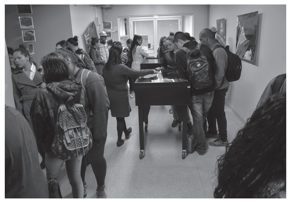
Photograph 6: "Women Weavers Challenge EJA" exhibition, IFRS, 10/26/2016 (photograph by Suzana Pires, 2016).

The pedagogical window of opportunity that emerged in this art studio, due to the artisans' generosity to let researchers enter this place, allowed curiosity to seek knowledge in places where we are often led to believe there is none. Doubting was one of the investigative steps that enabled this shift in attitudes on the part of ourselves and the other people involved. And from that moment on, remembering, imagining and pronouncing were the elements which impelled us to think about what an art studio was and what an art studio might become based on the contingencies that are marked in the artisans' lives.