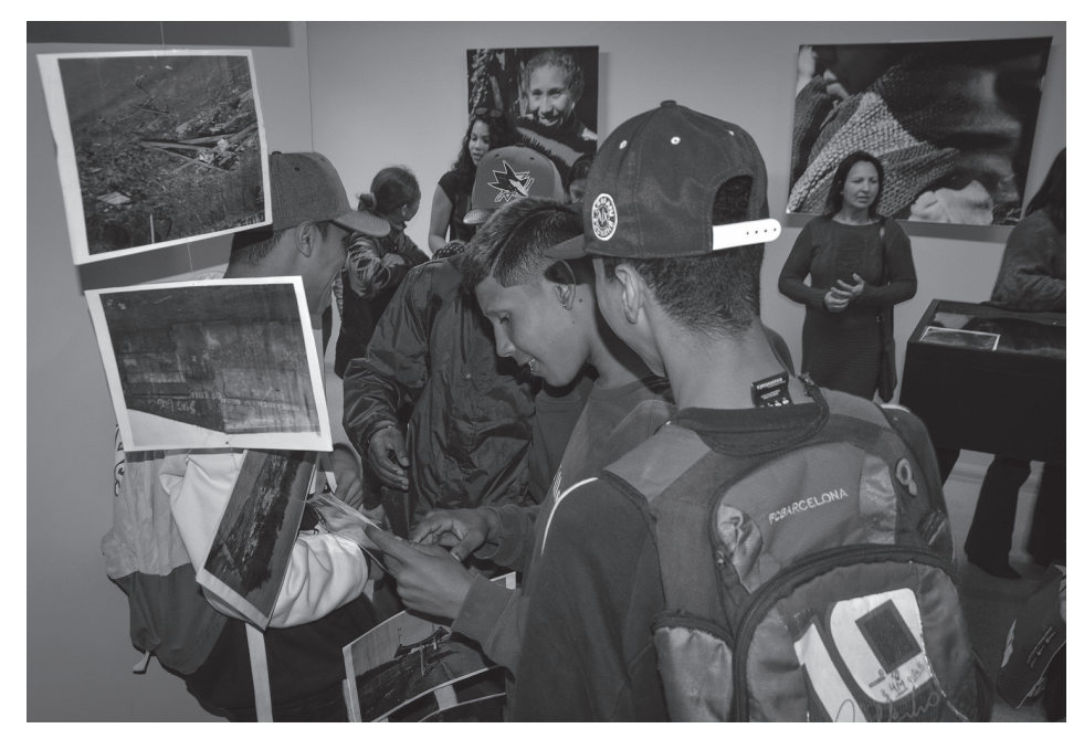
Photograph 5: "Women Weavers Challenge EJA" exhibition, 10/26/2016 (photograph by Suzana Pires, 2016).

Adichie (n/d) it is a history which is not always recognised. The stories of women who work in handcraft production in Brazil (and, most likely, the same holds about the whole world) are similar, these women were taught by their environment to think that what they do is not very worthy. In order for this to change, it is necessary to change places, to step back in order to see at a distance what is done and how the work is done and, what is fundamental, to imagine other perspectives in how to recount this history. Far beyond just the weaving work, the art studio is a place of looking at the world and being seen as a woman artisan who also happens to be a producer of knowledge. Personally, we view art studios as places of learning and teaching.