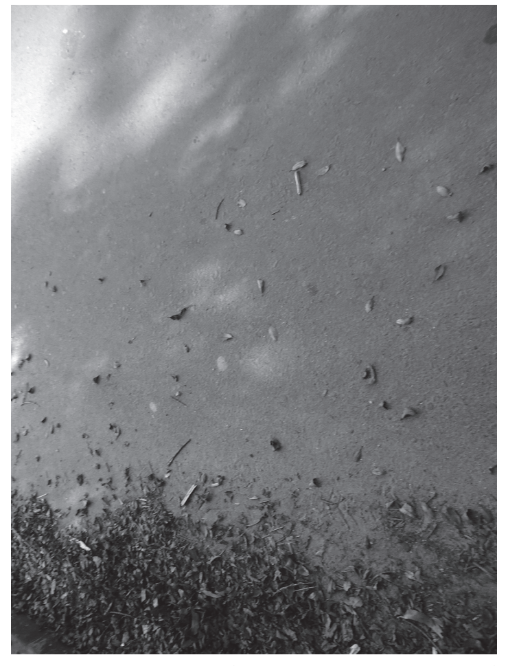
Photograph 2: "The Ditch Curtain".

Jaine Navarro (2014) analyses her creation, a curtain inspired by some dirt left at the edge of the road by a storm, thusly, "This curtain was inspired by this picture here, and I wanted to make it very real... That's why I put these little things here, because