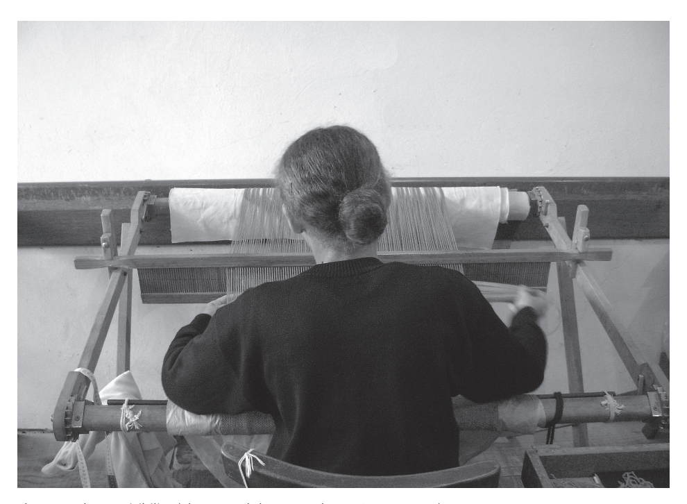
Photograph 1: Invisibility.

With regard to the context of handcraft production in Brazil, 85% is produced by women who are marginalised and invisibilised, without a face and without their signature under the works they produce. The women participating in this study, which was committed to constantly submit and present its results back to them, are