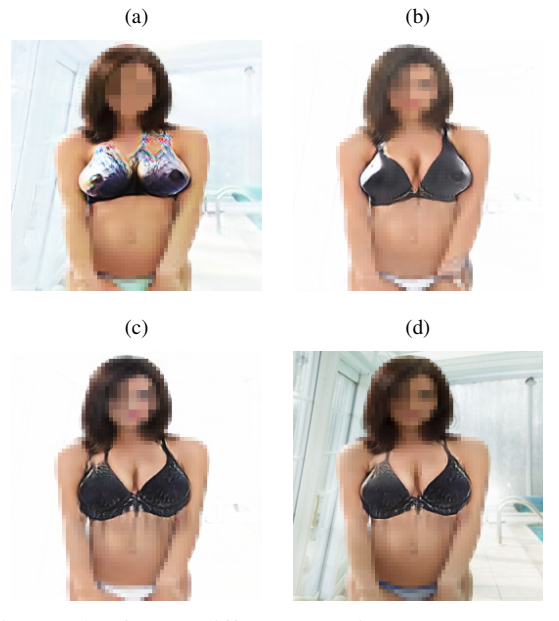
Fig. 5: Samples from 3 different experiments. a) AttGAN with 200 epochs; b) AttGAN trained by 500 epochs; c) AttGAN + trained by 500 epochs; d)enhanced AttGAN +. For privacy reasons we have manually blurred all faces.

which in turn is an evolution of the CycleGAN [4] framework for automatically covering intimate body parts without explicit supervision and/or paired training samples.