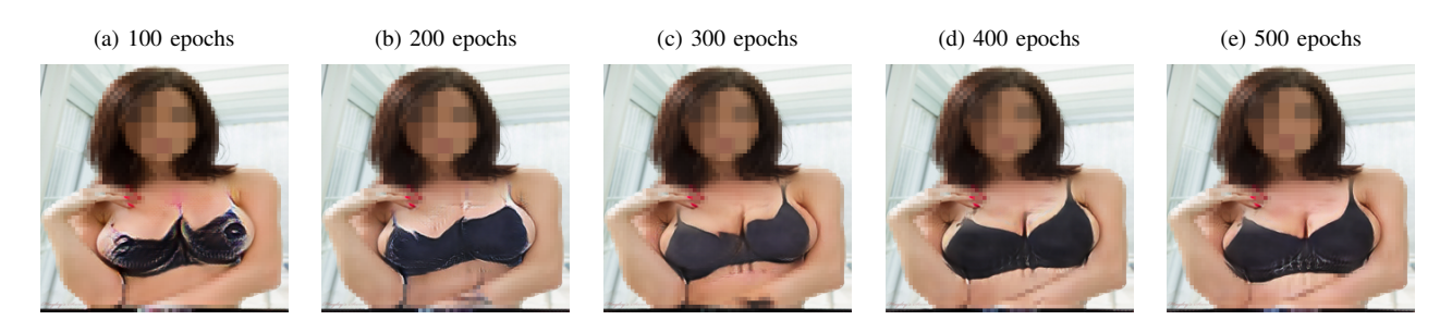
Fig. 2: The same sample from domain A after translation within 5 different training epochs. Results from method AttGAN++. For privacy reasons we have manually blurred all faces.

the quality of the generated images and compare them with baseline methods.