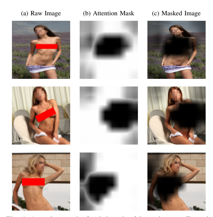
Fig. 4: Attention masks for 3 domain A input images. For privacy reasons we have manually blurred all faces and covered the intimate parts with red tags.

attention masks generated by the softmax layer of AN for 3 input images from the test set. The intimate regions observed in Figure 4b are coherently aligned with the original image. Figure 4c confirms that assumption when masking the image and fully supports our intuition that by feeding the input with additional information we can improve the generator capabilities and reinforce transformations at sensitive areas.