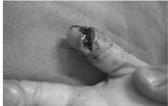
Fig. 2 – Crushing of the thumb: volar view.