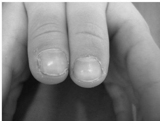
Fig. 5 - Final result.