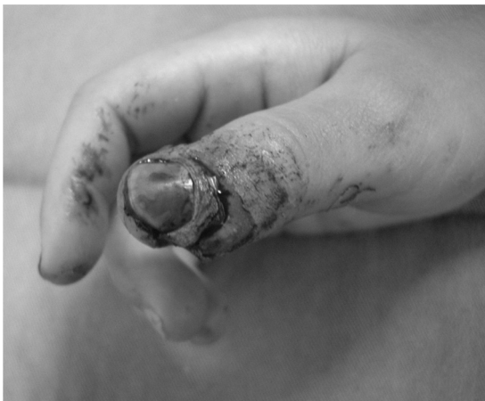
Fig. 1 – Crushing of the thumb, with subungual hematoma.

We reviewed 109 patients with trauma of the nail complex seen between January 2000 and December 2009. The mean age was 19 years (range: 16–48). The inclusion criteria were that these patients needed to have nail bed injuries with or without associated fractures of the distal phalanx, with a minimum follow-up of 18 months. Of these patients, 15 were excluded because we did not reach the postoperative length of follow-up proposed for the study, thus leaving 94 patients. The surgery was all performed by the same team, under locoregional anesthesia, or under general anesthesia in cases that required nail bed grafting from the hallux. In 42 patients, we performed simple suturing of the nail bed (SS) (Figs. 1–5); in 27, suturing of the nail bed followed by osteosynthesis of the distal phalanx (SO); in 15, immediate grafting of the nail bed (IG); and in 10, later grafting of the nail bed (LG), i.e. more than five days afterwards.