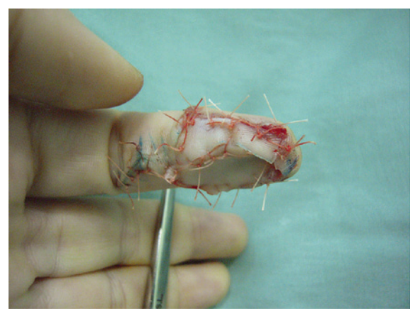
Figure 4 – Flap of the pulp exchange, with skin grafting at the donor area.