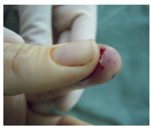
Figure 3 – Bi -digital pinch with the thumb, indicating the region to be reconstructed.

With regard to the distribution of injuries, the most affected digit was the thumb in 5(31.3%) patients; 4(25%) patients had lesions in D2, 2 (12.5%) in D3, 2 (12.5%) in D4, and 3 (18.7%) in D5.