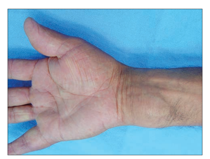
Figure 11: Wrist tumour