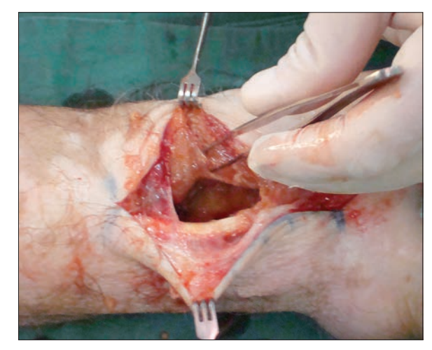
Figure 3: Cavity after synovectomy

fingers and wrist flexion limitation. He was diagnosed of synovial cyst and treated twice with direct puncture without improvement. There was no family history of pulmonary tuberculosis [Figure 4]. During surgery, it was observed an extensive hypertrophy of the synovial capsule of the flexor tendons and 'rice bodies' around the tendon [Figure 5].