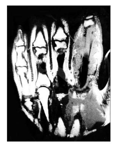
Figure 7: Magnetic resonance imaging of index finger with synovial hypertrophy