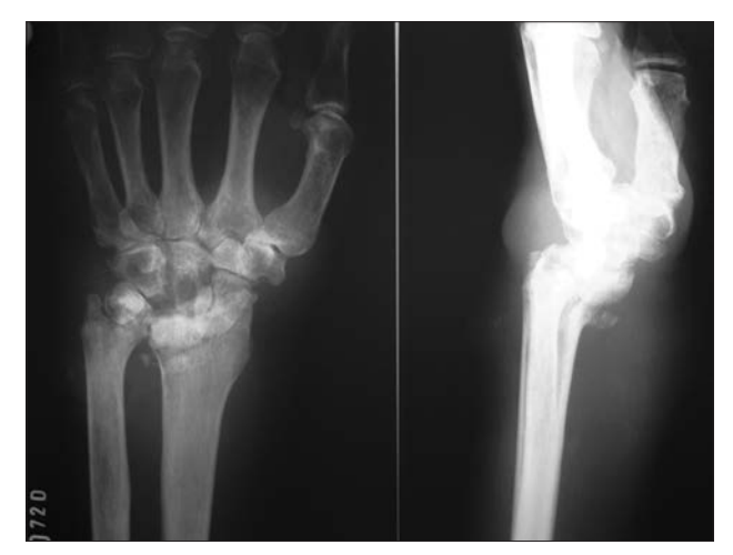
Figure 2: X-ray details