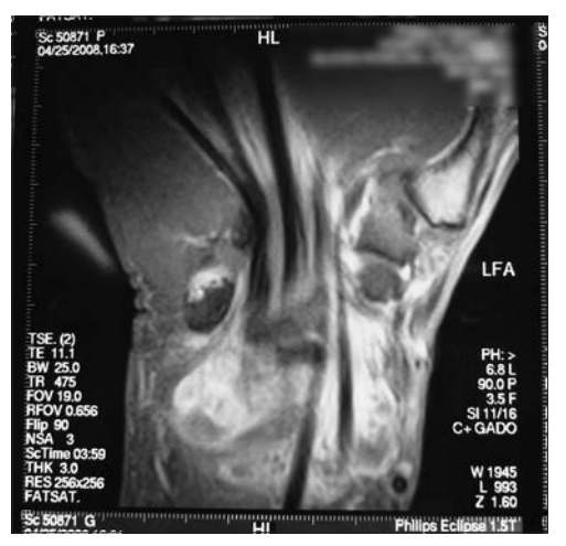
Figure 10: Computed tomography with peritendinous hypertrophy