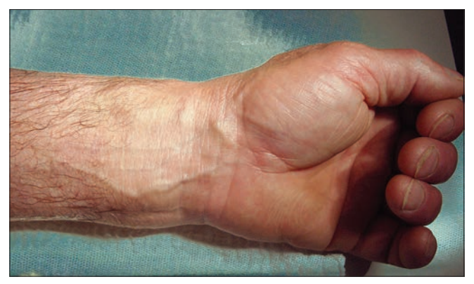
Figure 8: Volar wrist tumour