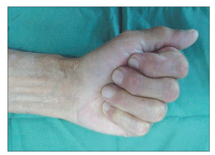
Figure 13: Functional result

Case 5 result at 1-year after surgery and chemotherapy with antituberculosis drugs. Note the decrease in the volume of the thumb and fifth finger after conservative treatment in these specific areas [Figure 15].