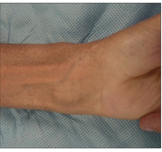
Figure 4: Wrist tumour

A 38-year-old male patient with a tumour on the volar and ulnar side of the left wrist with 5 months of progression. The clinical examination presented intense pain during flexion-extension of the fourth and fifth fingers. The patient has a brother with pulmonary tuberculosis [Figure 8]. During surgery, synovial capsule hypertrophy with 'rice bodies' structures was observed [Figure 9]. Computed tomography of the left wrist shows peritendinous tissue hypertrophy and compression of adjacent structures [Figure 10].