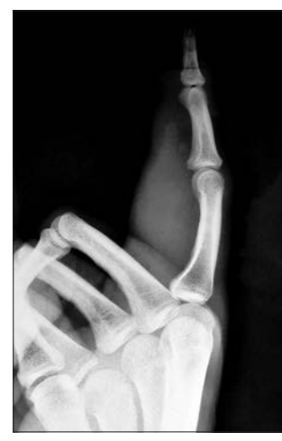
Figure 6: X-ray of index finger