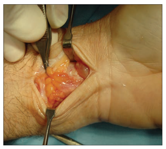
Figure 9: Rice bodies