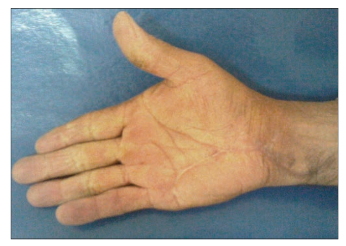
Figure 15: Final aesthetic result

Synovial biopsy is important for diagnosis and was performed in all patients (excisional biopsy) confirming the diagnosis by specific Ziehl-Neelsen staining and culture for AARB.