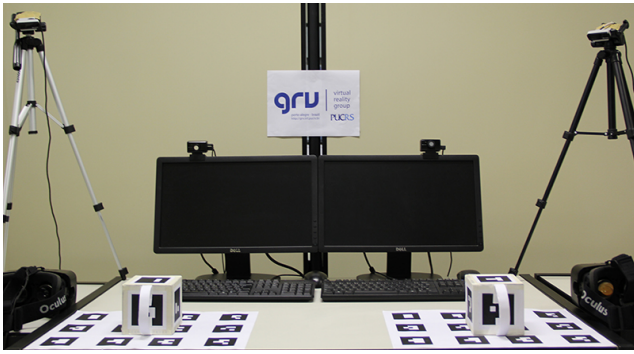
Figure 1: HMDs, webcams and AR cubes.