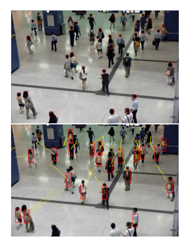
Figure 2: Tracking phase in our approach. On the top: the input image and heads detection, and on the bottom: the people detection and tracked trajectories.

algorithm can be used in this phase. Figure 2 illustrates the output of this step.