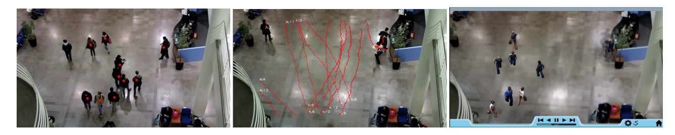
Figure 1: Overview of our method: on the left side real people trajectories are detected and tracked in a video sequence; in the center the trajectories are used to learn patterns of motion in our method, and on the right side our viewer illustrates population for a game, based on real life trajectories.

Virtual Human Simulation Laboratory – VHLab Pontifical Catholic University of Rio Grande do Sul, Brazil