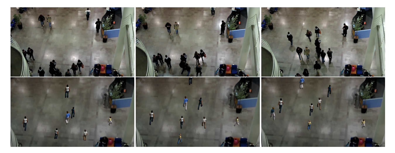
Figure 4: Original Video Sequence (on the top) and Simulation (on the bottom) based in video (BR-01).

This paper presented a method to continue videos for a certain time keep going agents in the scene and creating others, according to the observed motion patterns. Results showed the generated