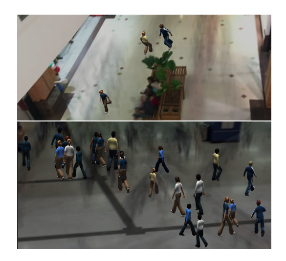
Figure 5: Simulations generated as a function of videos BR-07 (top) and UKN-02 (bottom).

shows some frames of an original sequence (on the top) and a simulated one (on the bottom). In such figure it is possible to note that the main trajectories are equivalent. In addition, the density of created agents can be adjusted using K value.