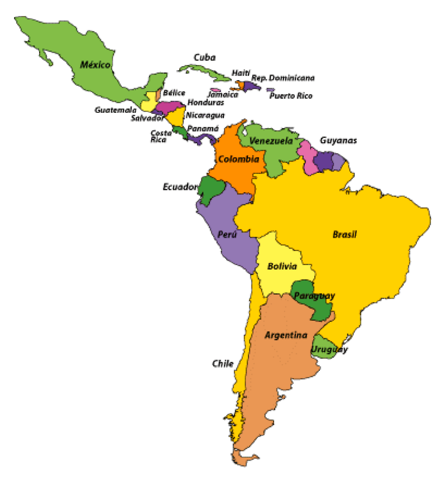
Fig. 1. Latin America (LATAM) geographic political map. Foot Note, Fig. 1. LATAM zones. North America: Mexico; Central America: Guatemala, El Salvador, Honduras, Nicaragua, Costa Rica, Panama; Spanish Caribbean: Cuba, Puerto Rico, Dominican Republic and Aruba. South America: Venezuela, Colombia, Ecuador, Peru, Bolivia, Chile, Paraguay, Argentina, Uruguay, Brazil.

The Caribbean Spanish-speaking island countries: Cuba, Puerto Rico and Dominican Republic are also included in the LATAM geographic and cultural concept (Fig. 1). The LATAM population (as per February 20, 2021), is reported by the United Nations as 657,680,320.