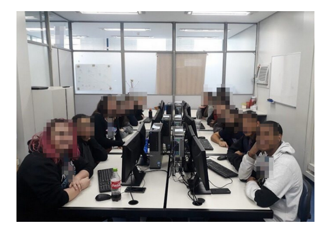
Figure 8: Students Working on Their Tasks