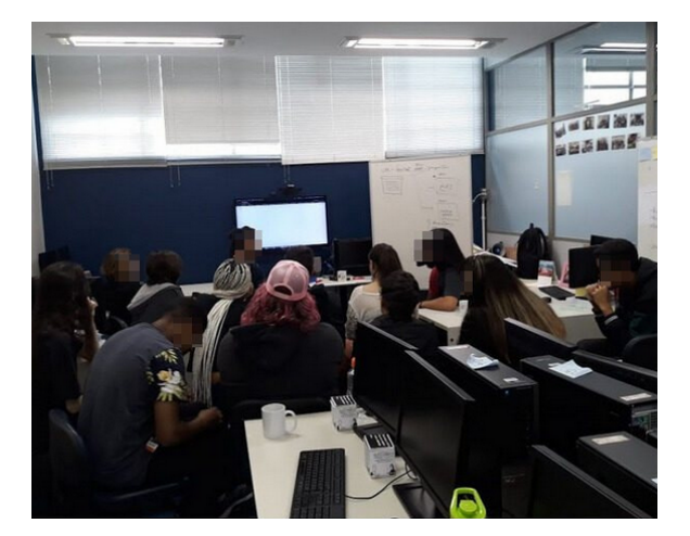
Figure 5: A Example of a Technology Session

SBES '20, October 21-23, 2020, Natal, Brazil