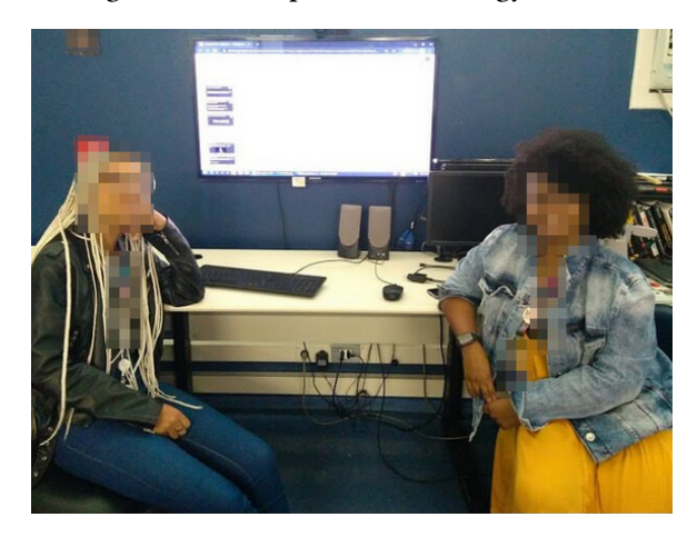
Figure 6: A Technology Session Organized by a Student

product to be developed, understanding customer needs and thinking about deliverable versions (MVP). At this Phase, instructors seek to explain to students that the focus of the Program is not on developing a perfect software but on learning, but it is recurring that students worry about delivery while forgetting this purpose. Phase 4 - Iteration 1 to 5: It is the longest, taking around 10 weeks and every 2 weeks the mentors conduct a retrospective session (Figure 7) with the class to resolve any technical impediments or conflicts [16]. In this phase, students produce the application requested by the customer (Figure 8). With the help of the instructors, the students have the kanban with all the stories and tasks set and every day when they arrive, they do a daily [16] to decide whom they will work with and what story they will develop, based on the customer needs. During this phase, the main development practice used is pair programming, however, when the stories to be developed are very complex the students perform a Dojo involving the whole class (Students may use the Slack channel to make questions). Also, at times students get tired of programming in pairs, causing them to rarely take on other forms of organization such as programming in threesomes or dojos.