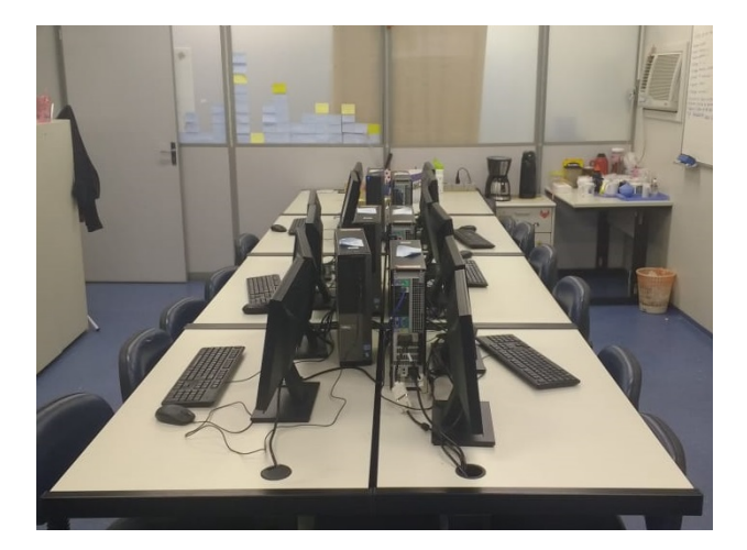
Figure 2: The Pair Programming Environment