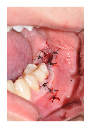
Fig. (1). Decompression device in place after incisional biopsy.

In a histological comparison of the incisional biopsy performed at the time of decompression device placement and after enucleation and curettage [resection], all patients showed epithelial differentiation, where the cystic epithelium became hyperplastic and a subepithelial inflammatory infiltrate was observed (Fig. 2).