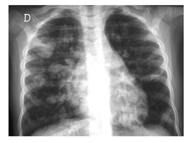
Fig. 1. A 6-year-old boy with RRP. Frontal chest X-ray shows multiple nodular cavitated lesions scattered throughout the lungs.

Virtual bronchoscopy is an alternative method for CT-based assessment of the tracheobronchial tree. It enables visualization of the airways on three-dimensional images, after processing using specific imaging protocols. This noninvasive method has the advantage of avoiding possible complications of conventional bronchoscopy, such as perforation, infection, and hemorrhage. Furthermore, the presence of airway stenosis is not a limiting factor, as this method enables visualization of the trachea and bronchia beyond the region of stenosis [9]. Magnetic resonance imaging can