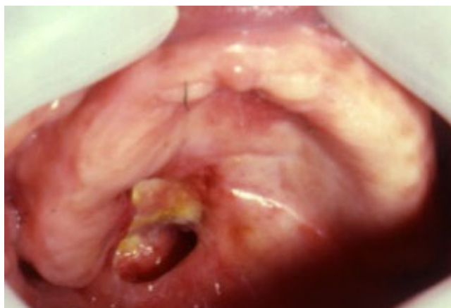
Fig. 4 Syphilitic gumma, presenting as a necrotic lesion, causing bone perforation in the palate

more than 90% of the lesions were unique, with an average duration of two weeks. A justification for the discrepant results in relation to the clinical aspect can be found in the time of evolution of the lesions, which in our study was three and a half months. The literature shows, however, that most oral lesions of secondary syphilis are multicentric, as observed in our study. 10,13,20 In both studies, the most affected sites were the lips and tongue, and in most cases the patients presented painful symptoms. In another study where 37 cases of secondary syphilis are described, 18 the clinical presentation was mostly a