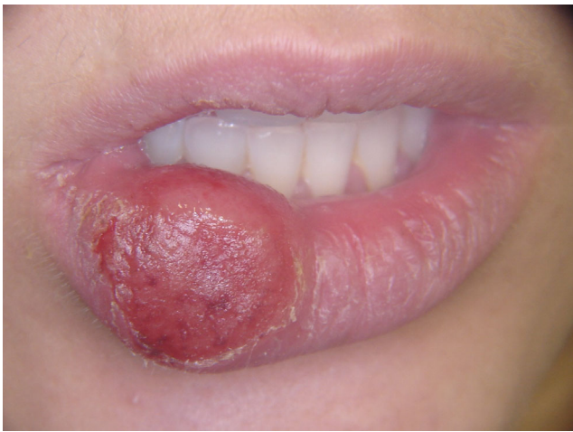
Fig. 1 Chancre located in lower labial vermilion, presenting as extensive nodular, ulcerated and firm consistency lesion

of the lesions are described in Table 3. The lesions in most cases presented as white or grayish-white plaques, of pearly aspect, associated with reddish macules (Fig. 2). In approximately 18% of cases, there was concomitant presence of mucosal plaques and erosive or ulcerative lesions (Fig. 3). Painful symptomatology was reported by 91.7% of patients, and duration of these lesions was on average three and a half months. In 43 (39.4%) cases, patients reported skin lesions concomitant with oral lesions, with the trunk being the most affected site, followed by the palms, abdomen, legs and plant of the feet. In 20% of cases of secondary syphilis, patients reported a history of genital lesion.