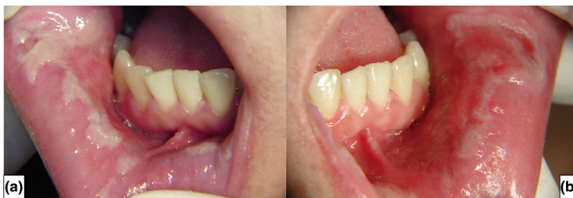
Fig. 2 Mucous patches, presenting as grayish-white plaques, of pearly aspect (a), associated with reddish macules (b)