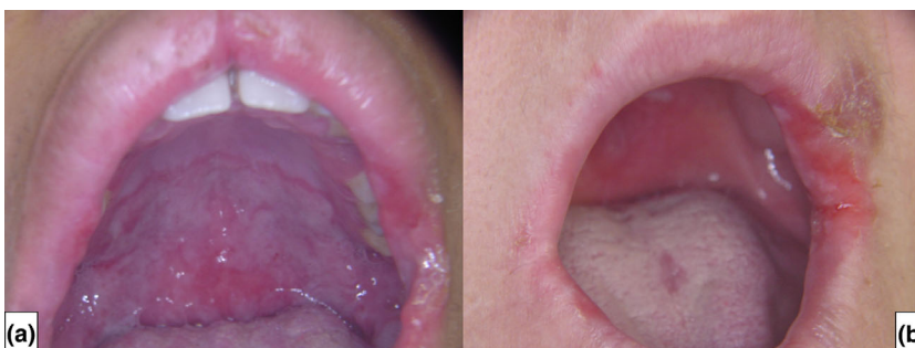
Fig. 3 Grayish-white mucous patches associated with reddish macules in soft palate (a) and erosive/ ulcerative lesions in labial commissure (b)