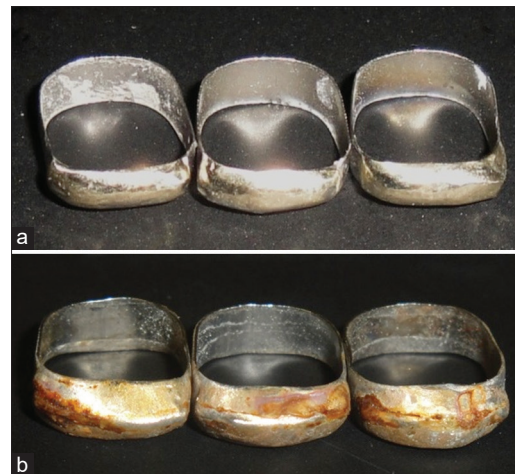
Figure 2: Bands (a) before and (b) after the elution period

It could be observed from this present and in vitro investigation that several toxic ions are released from silver-soldered bands independently of the polishing method adopted. Silver soldering can affect ion concentrations in a saline solution and the surface roughness can contribute to higher release. There is a trend that the lower the surface roughness, the lower the levels of ions released. Nonetheless, our study conducted in vitro research, testing two polishing methods, and used saline solution for evaluation. It is also important to emphasize that the saline solution by itself may have caused corrosion in joints. Due to this limitation, it would be important that further studies investigate other methods and verify this data in vivo .