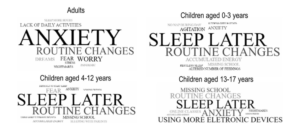
Figure 2 Tag-cloud with 10-most cited terms regarding participant's reason for altered sleep habits.