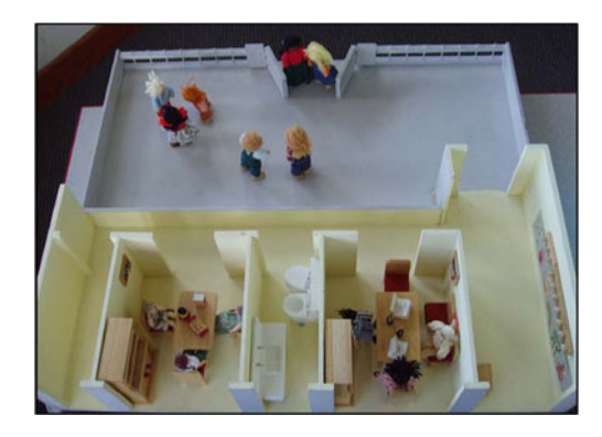
Fig. 1 Model school DP set up

Prior to the DP, the researcher confirmed school details with the mother. She then took the child into a comfortable room and showed the child a model school (see Fig. 1) placed upon a table, at which the child was invited to sit. A model dolls' house was also placed on the table 0.5 m from the school. The researcher explained that she knew that the child was shortly due to start school, and that they were going to pretend that the model school was the child's real school and that it was the child's first day. The researcher familiarized the child with the school layout (cloakroom, classrooms, bathroom and playground, populated by a number of dolls representing other children). The child was then invited to choose doll figures from a selection to represent themselves, their mother and teacher. The researcher then administered a series of story stems, using a standardized script and doll enactments. Four stems concerned school and culminated in an event that could potentially provoke anxiety, and particularly social anxiety. Stem 1 concerned arriving at school, and